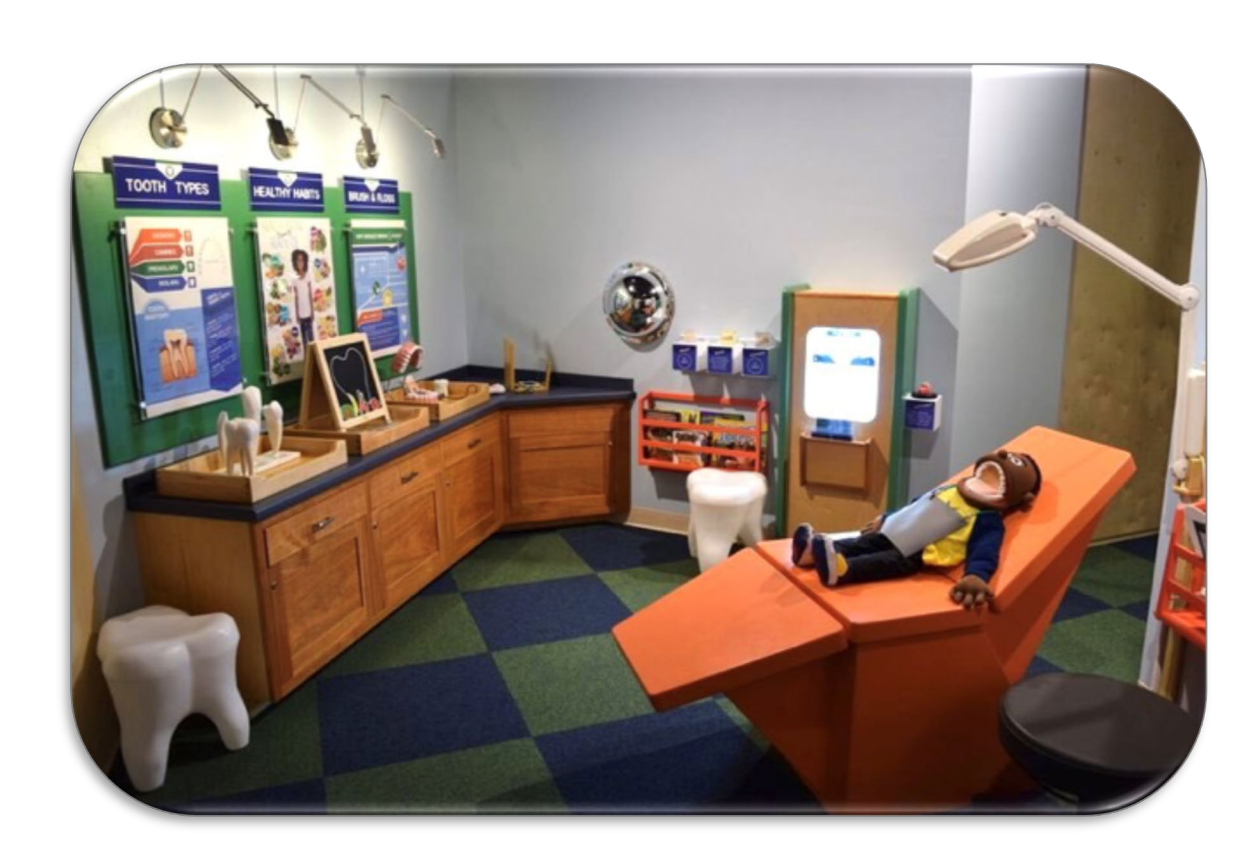
In the Dental Center, I can use a giant toothbrush to practice brushing teeth!

Another exhibit I might visit while at the Museum is the Friendly City Health Center, including the Dental Center and the Medical Center.